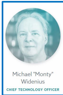
Michael "Monty" Widenius CHIEF TECHNOLOGY OFFICER